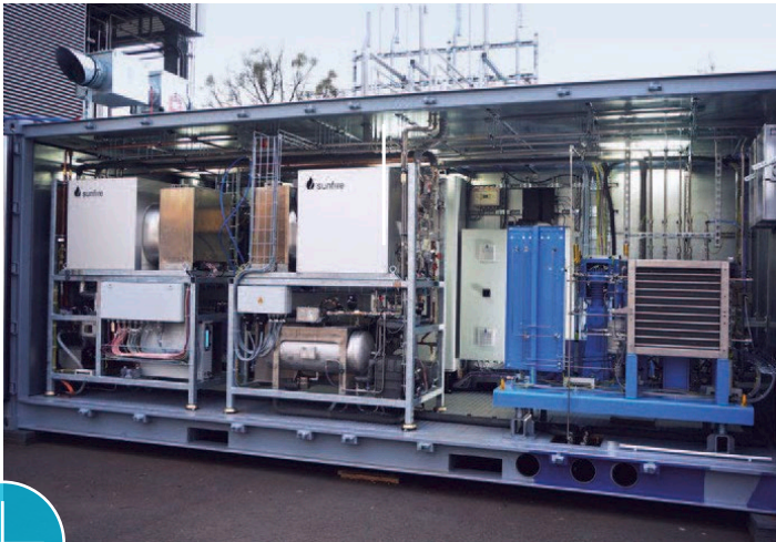
In Duisburg, the compressor was integrated into the infrastructure of a research institute.

» We are delighted to have Mehrer Compression GmbH at our side, a reliable expert in the field of oil-free compressors. Two compressors specially tailored to our requirements are used in a hydrogen filling station in Karlsruhe and a research institute ZBT in Duisburg.«